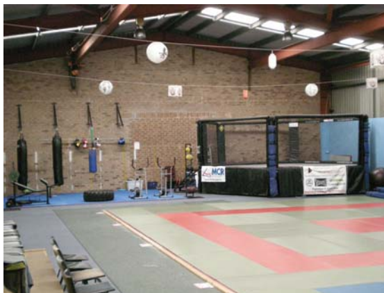
Wollongong Judo Centre

Recognition of current competencies may be available based on skills and knowledge already acquired (RPL) $250 to have this assessed